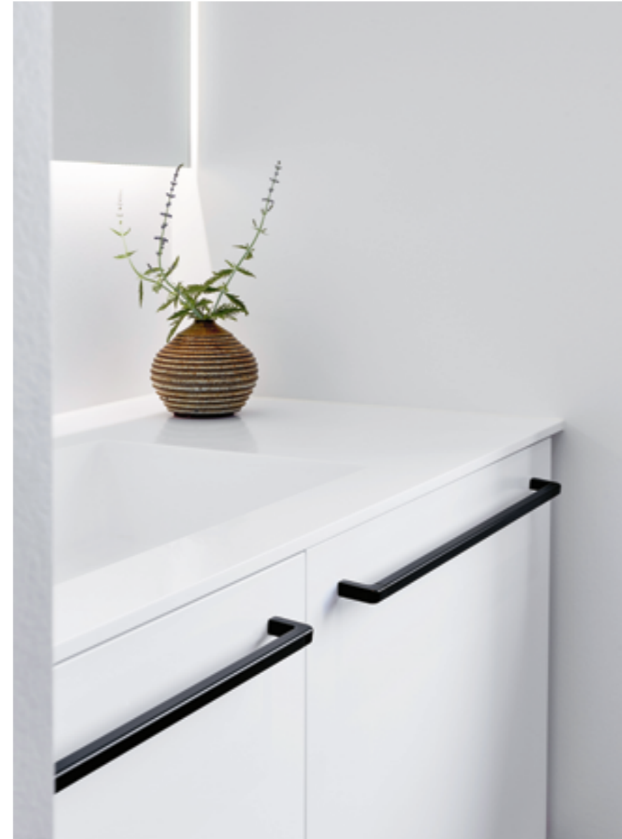
Mango | Designer: Kamper Form