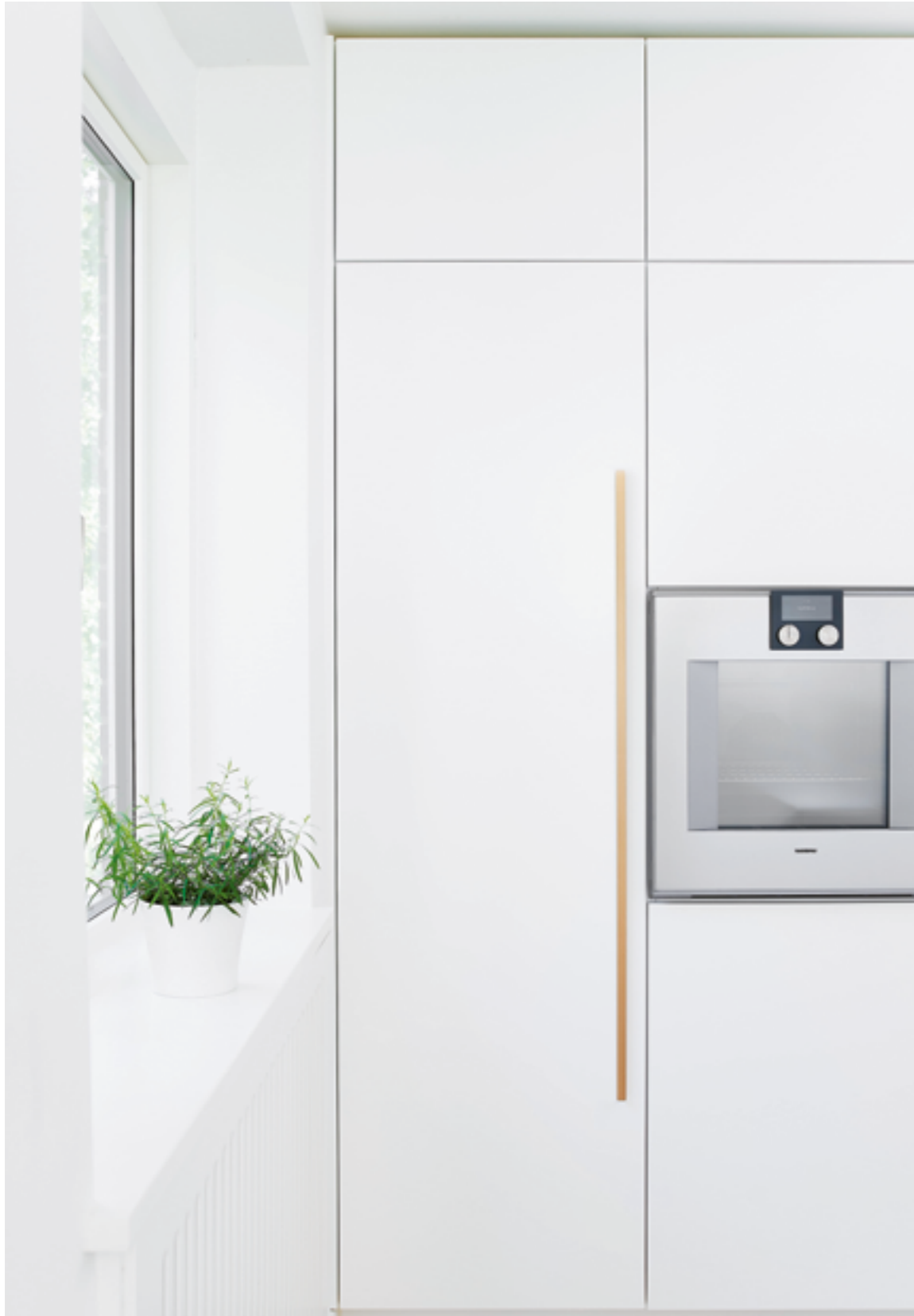
Elan 4533201088-31 | Finish: Brushed Brass CC: 160 + 544 + 1088 L: 1200 W: 20 H: 18