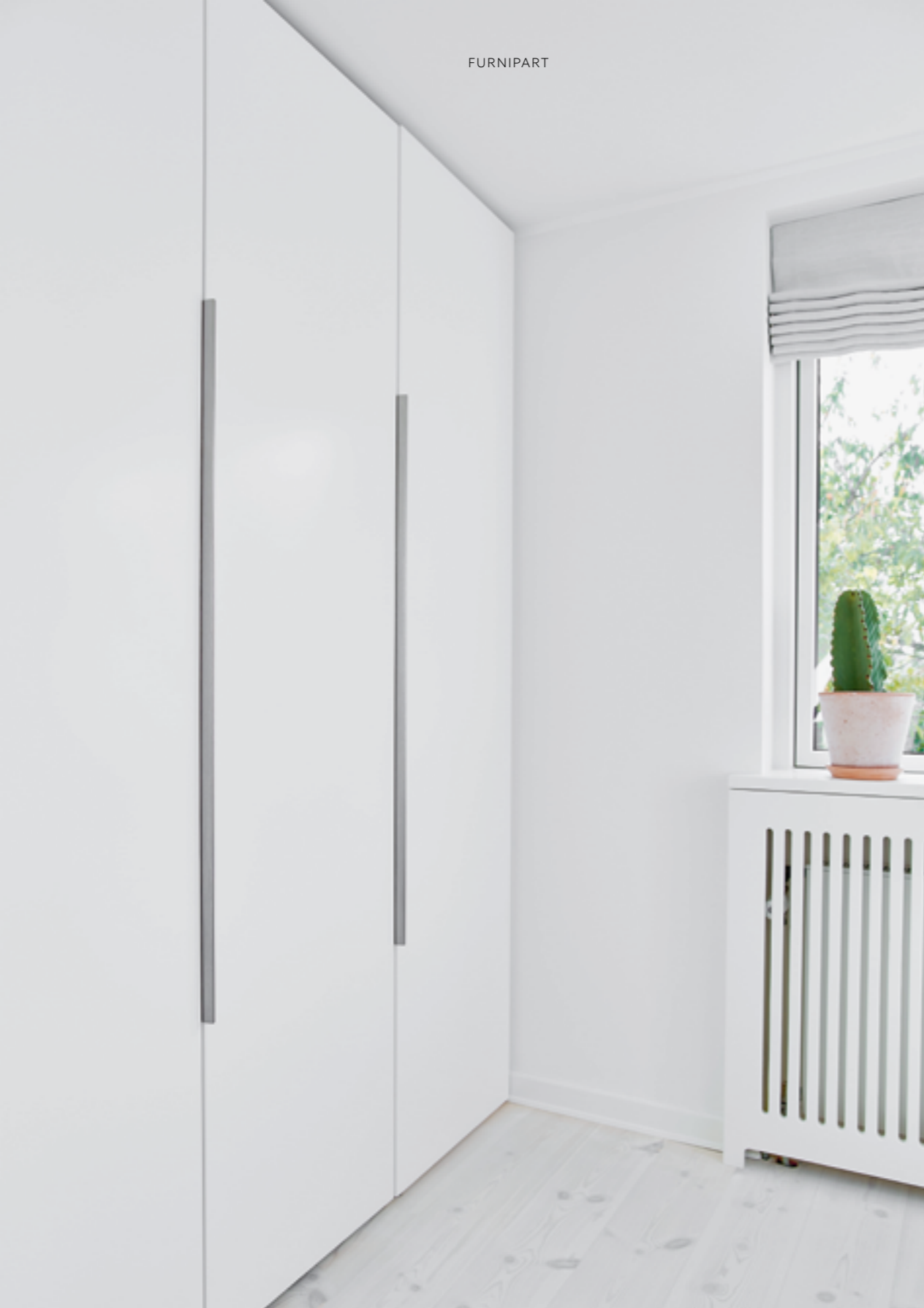
Edge Straight 4197201200-66 | Finish: Inox Look CC: 7x160 L: 1200 W: 40 H: 18