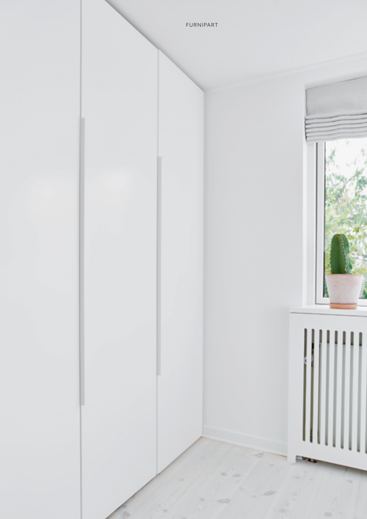
Edge Straight 4197201200-0500 | Finish: Matt White CC: 7x160 L: 1200 W: 40 H: 18