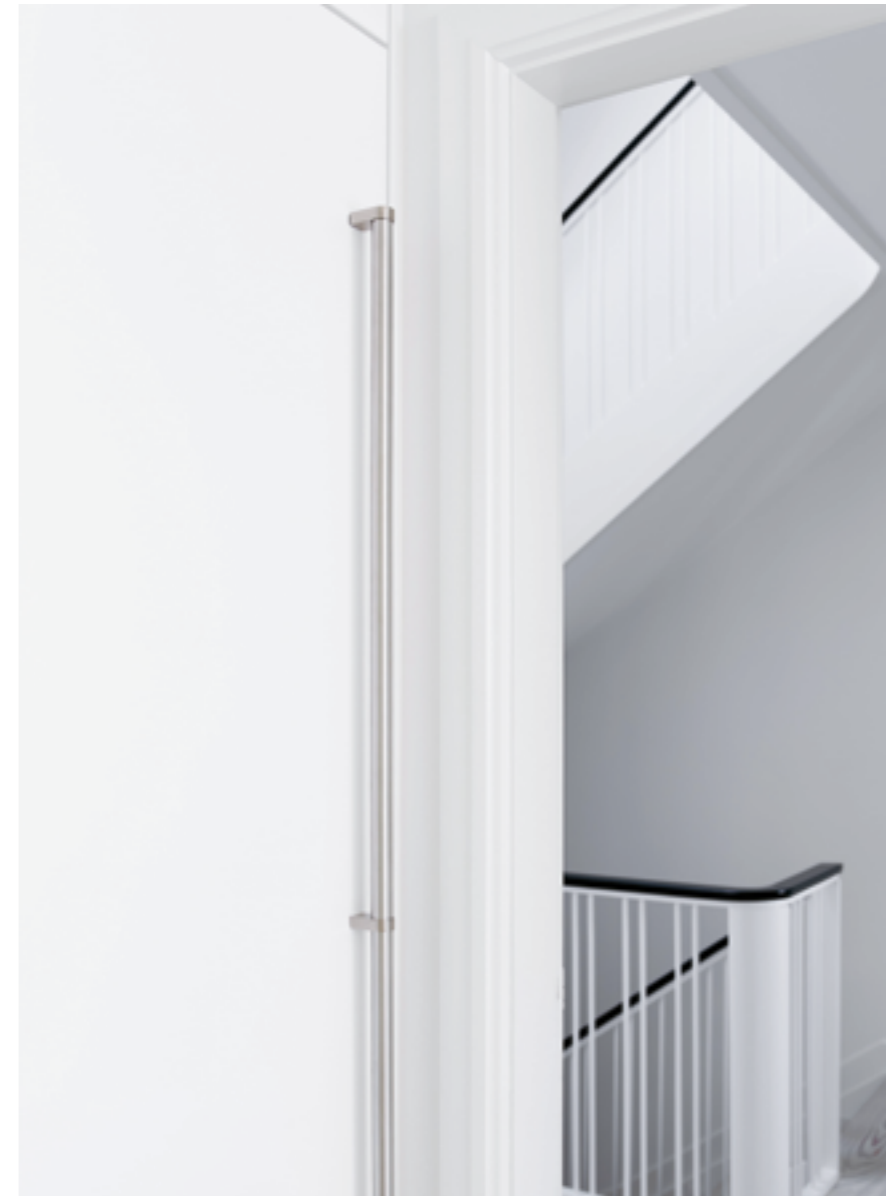
Big | Finish: 66 - Inox Look | Designer: furnipart