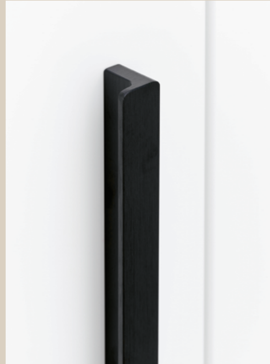
Elan | Designer: VE2