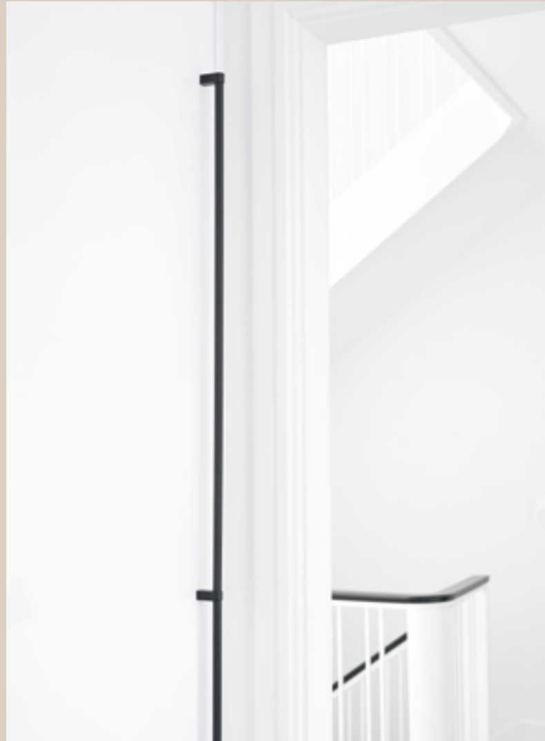
Regular 2 | Finish: 99 - Black L: Cut-to-size H: 40 Ø: 13