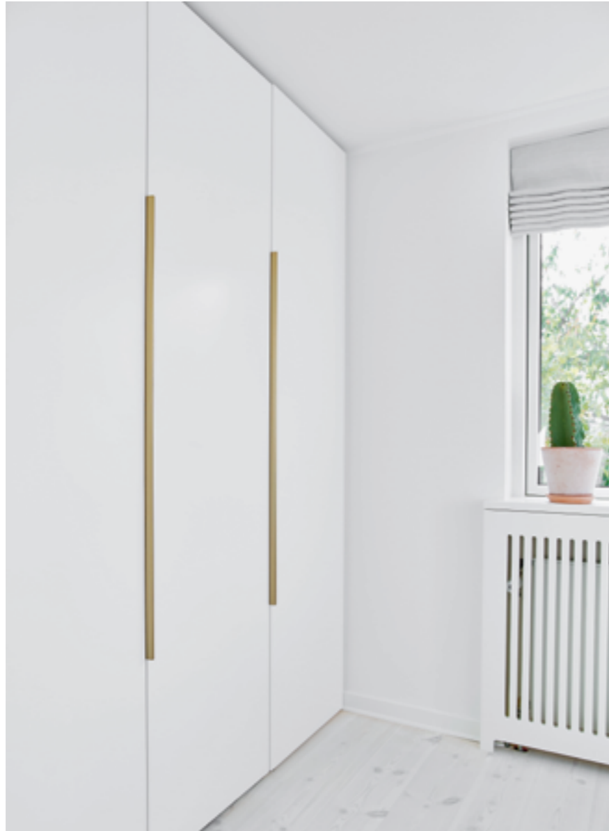
Edge Straight 4197201200-31 | Finish: Brushed Brass CC: 7x160 L: 1200 W: 40 H: 18