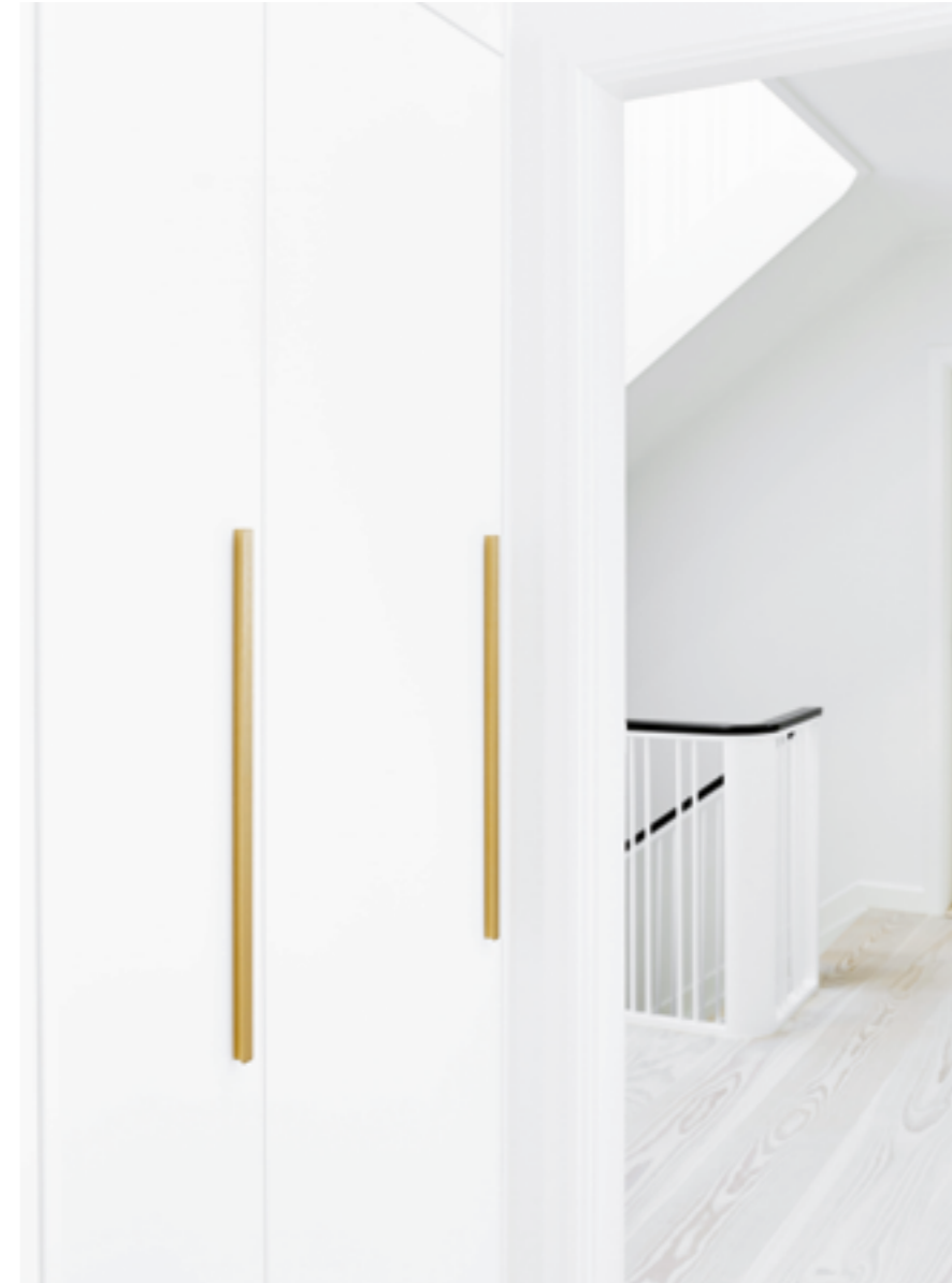
Elan