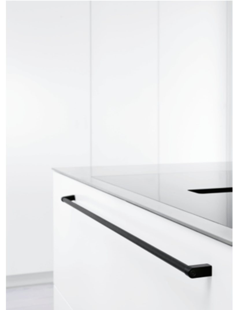
Regular 2 | Designer: Kamper Form | For more information see page 14-15