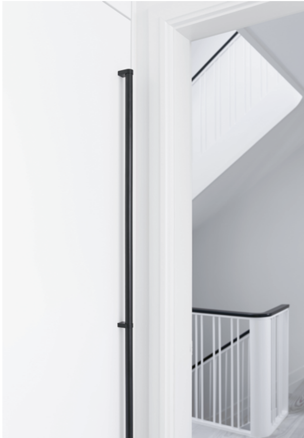
Big | Finish: 9005 - Black L: Cut-to-size H: 45 Ø: 22 | For more information see page 14-15