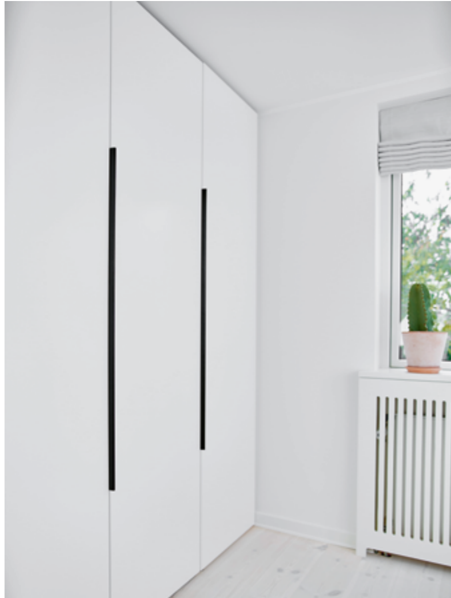
Edge Straight 4197201200-76.1 | Finish: Brushed Matt Black CC: 7x160 L: 1200 W: 40 H: 18