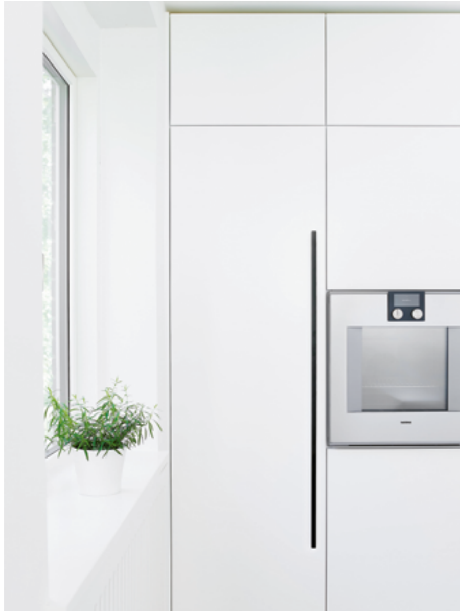
Elan 4533201088-76 | Finish: Brushed Matt Black CC: 160 + 544 + 1088 L: 1200 W: 20 H: 18