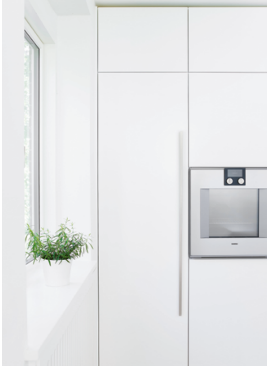
Elan 4533201088-66 | Finish: InoxLook CC: 160 + 544 + 1088 L: 1200 W: 20 H: 18