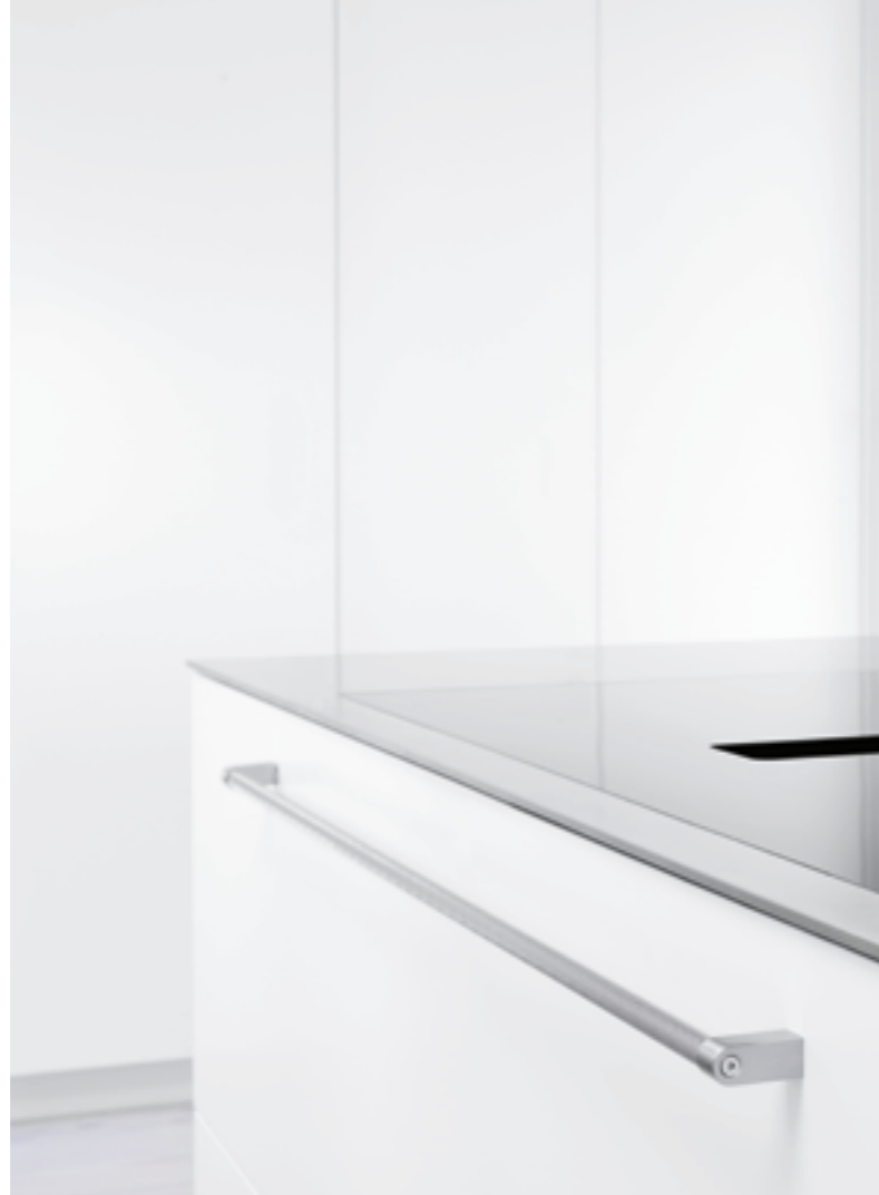
Regular 2 | Finish: 25/66 - Inox Look L: Cut-to-size H: 40 Ø: 13