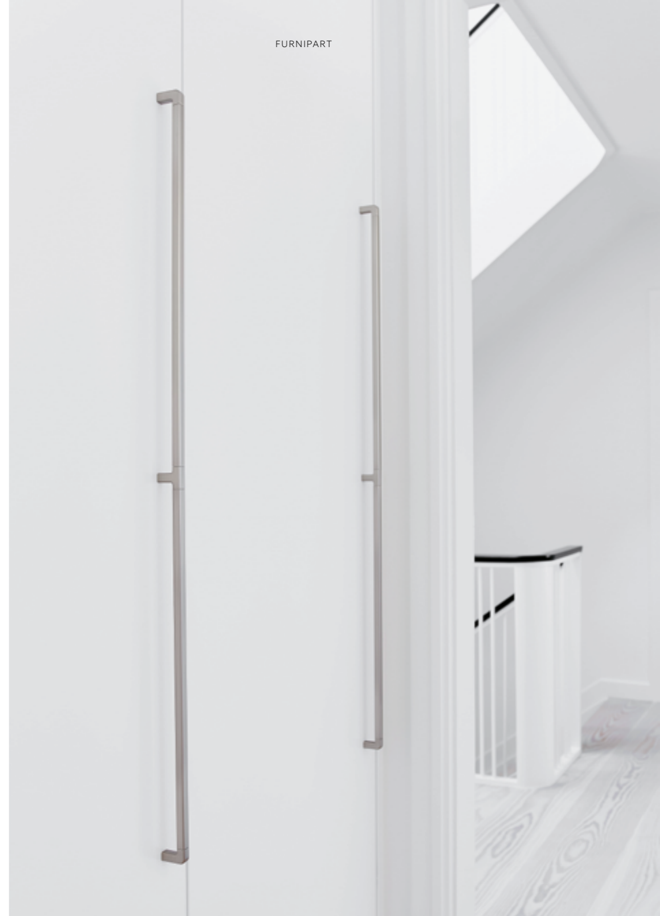
Mango 5524201088-66 | Finish: Inox Look CC: 2x544 L: 1100 W: 12 H: 35