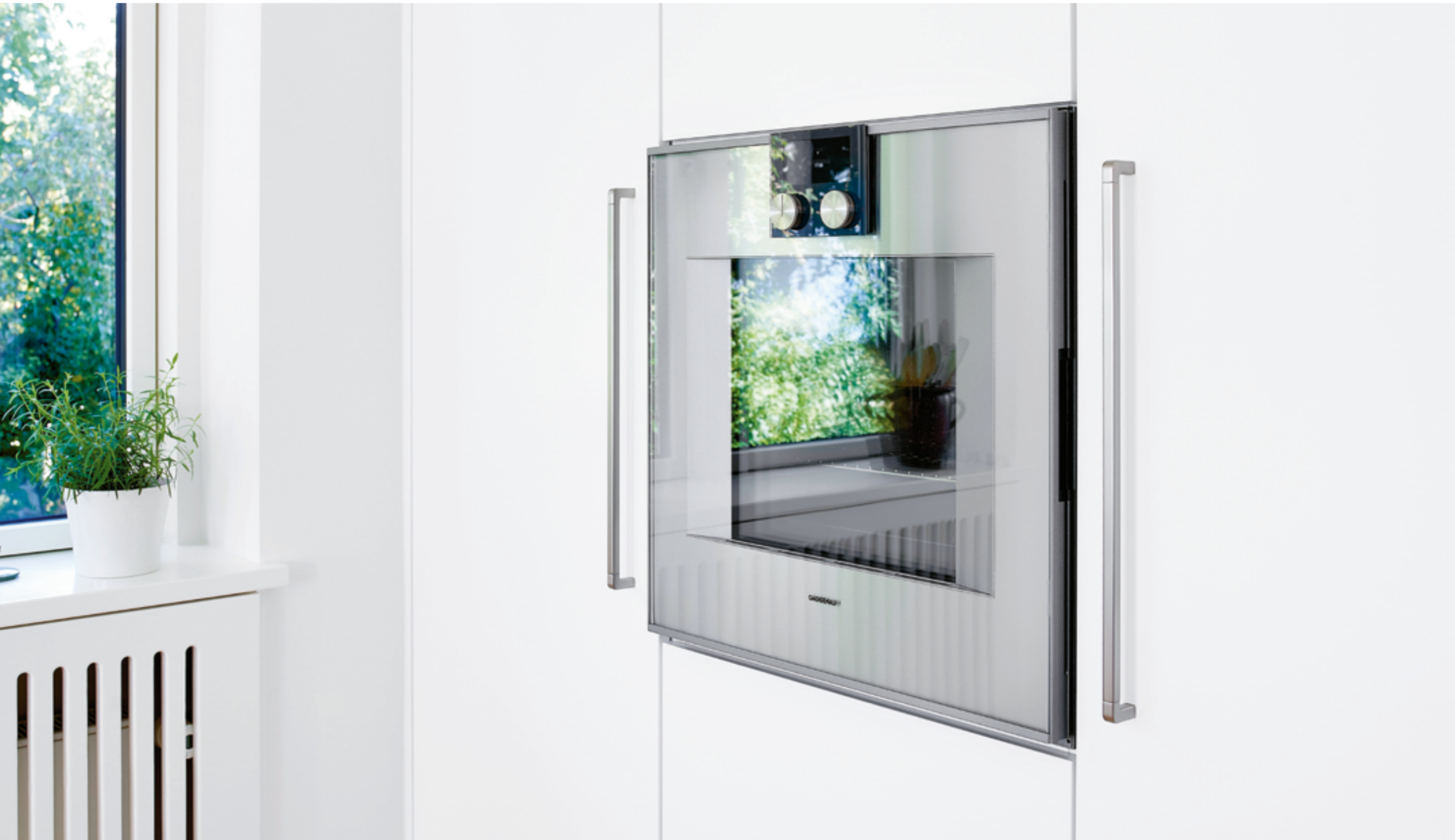
Mango 552420544-66 | Finish: Inox Look CC: 544 L: 556 W: 12 H: 35