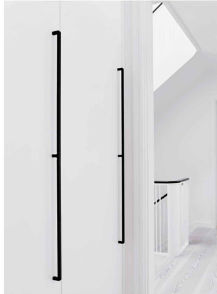
Mango 5524201088-9005 | Finish: Black CC: 2x544 L: 1100 W: 12 H: 35