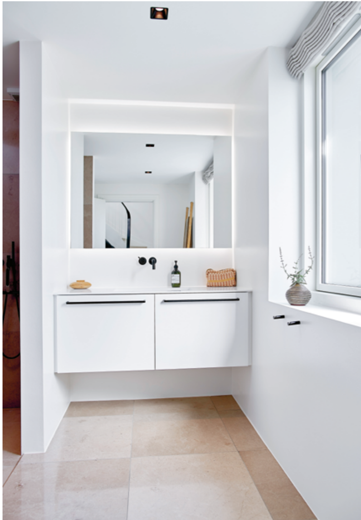
Mango 552420544-9005 | Finish: Black CC: 544 L: 556 W: 12 H: 35