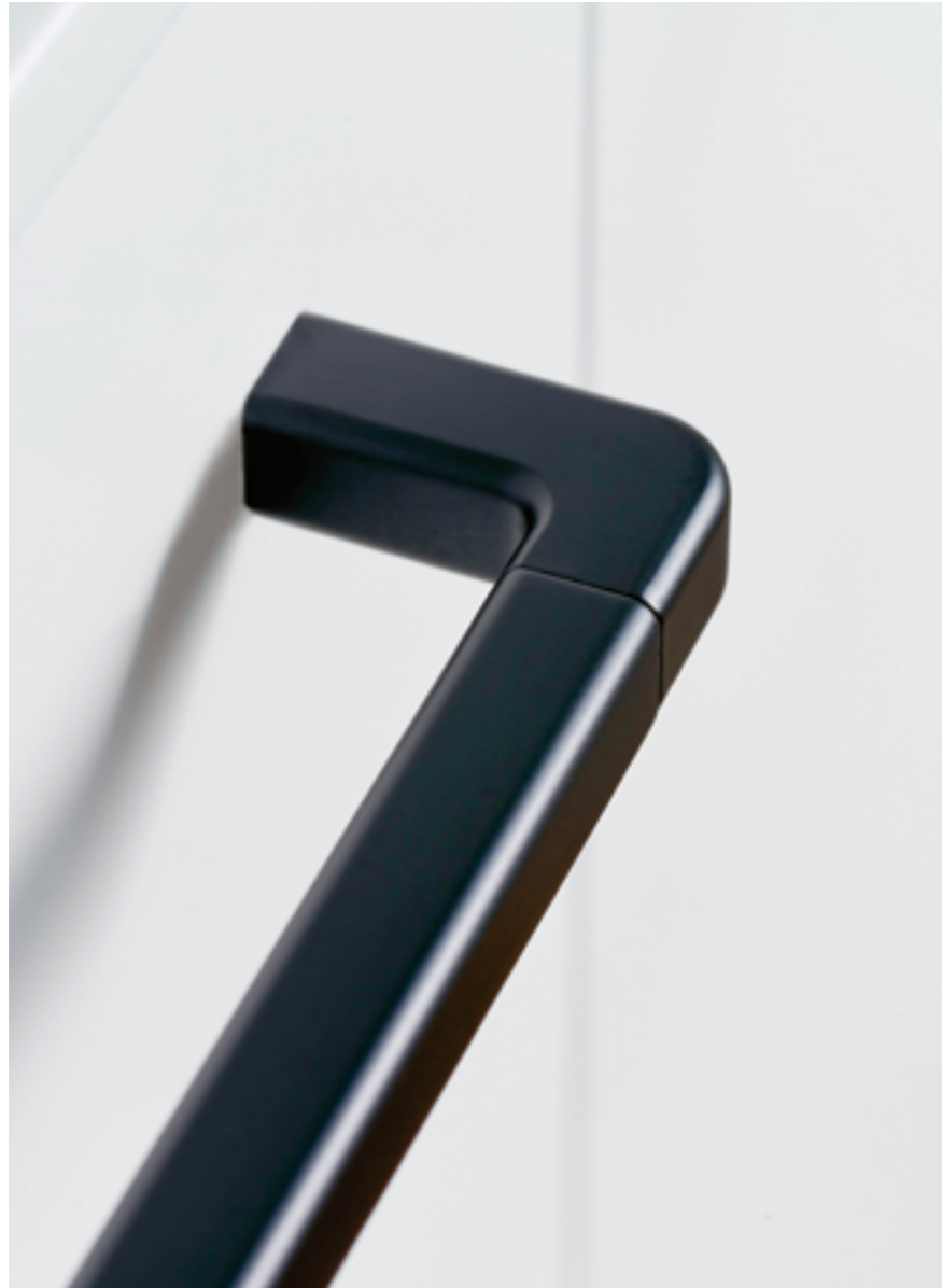
Mango | Designer: Kamper Form