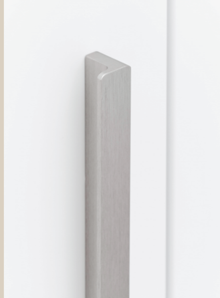
Elan | Designer: VE2