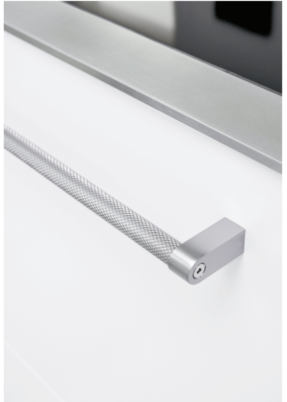
Regular 2 | Designer: Kamper Form | For more information see page 14-15